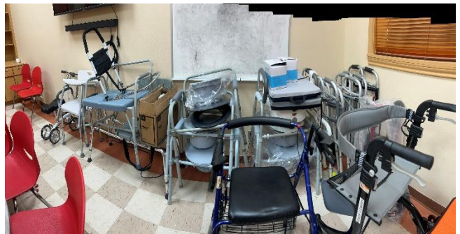
Free durable medical equipment