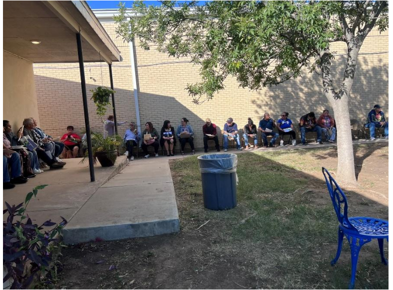
People waiting for free vision services and free glasses