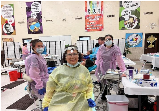
Everything free to all--This is our dental team.