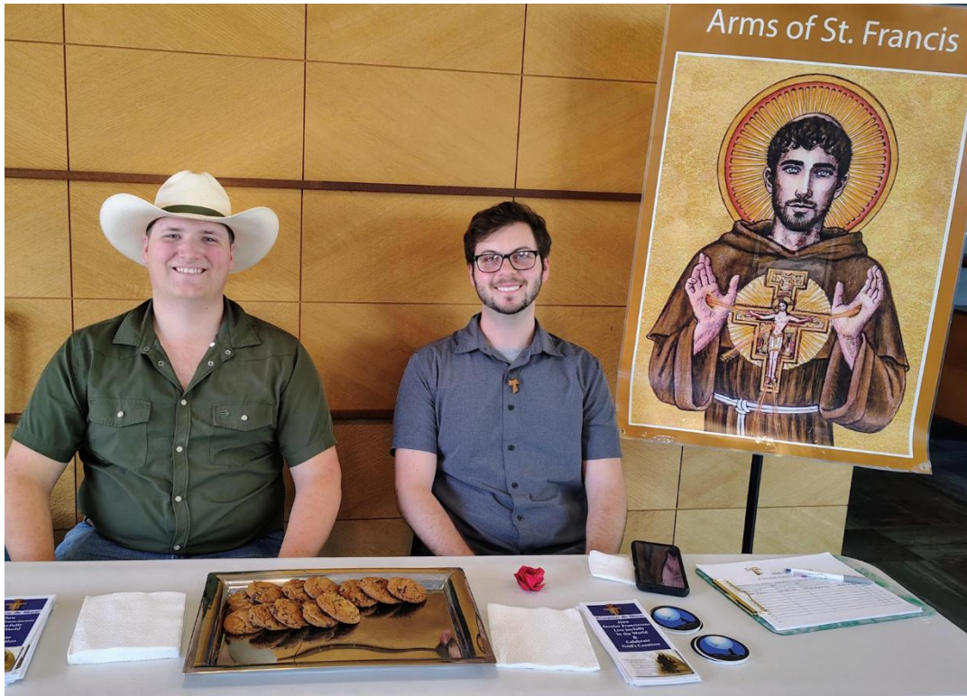
Fraternity members at a table set up at St. Mary's Church at Texas A&M at College Station, set up to inform students about St. Francis Assisi and the Secular Franciscan Order.